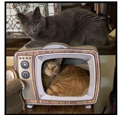
Dexter is waiting his turn to get into the TV after Nami. Yes, she still bosses everyone around.