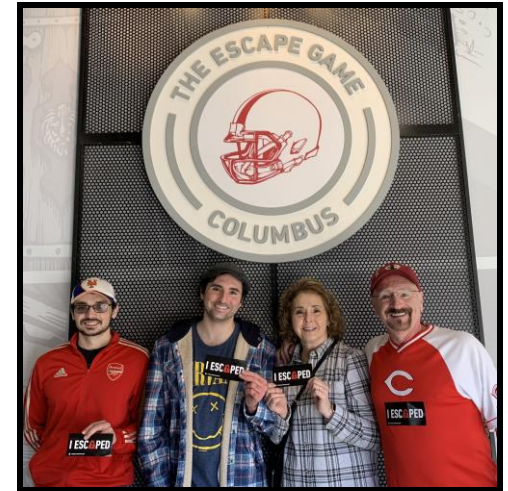
All of us at the Escape Room.

It is the end of an era. We worked on dad's house from January to July. It sold in about two days. After 55 years, it is a new family's turn to make memories.