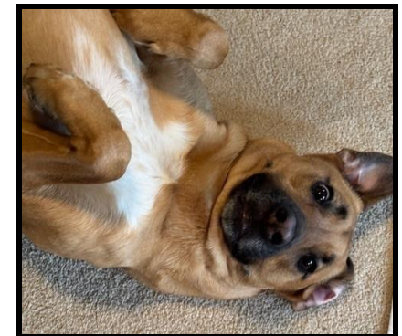
Gemma waiting to get her chest scratched.